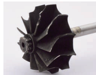
Turbine wheel failure through HCF