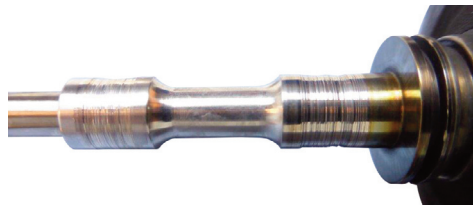
Another example here would be good to balance it all up